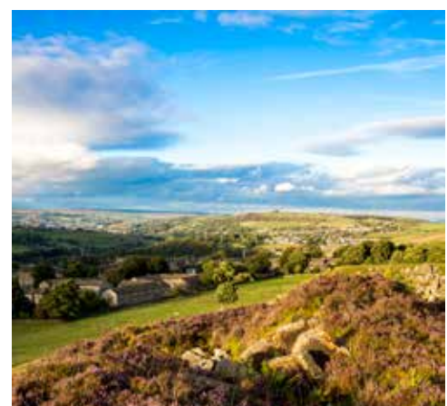
The moor is blooming Plump fruit begging to be jam Heather reigns supreme

Some are saying it is like the summer of '76. I don't know; I wasn't living in the UK at that time. All I can say is that weather-wise this is the best summer since I moved here in 1990. Enjoy every ray of sunshine. Also, be sure to get to Bolton Abbey's Pop Up Beach, by far the best 'seaside' experience next to the real thing